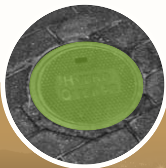
Man Made Object

LCMS-2 data is acquired and compressed in real time in the survey vehicle so as to minimize storage needs. The collected data can then be analyzed using Pavemetrics' data processing SDK (DLL library of C/C++ functions). The SDK includes functions to detect and analyze cracks, lane markings, potholes, ravelling and more. Rutting is also measured and characterized using more than 4,000 points. Concrete road surfaces can be scanned to evaluate joints, spalling and faulting between the concrete slabs. Options to measure longitudinal profiles, IRI and slope and crossfall are available with the built-in IMUs.